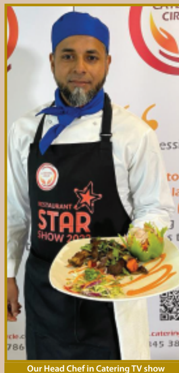
Our Head Chef in Catering TV show